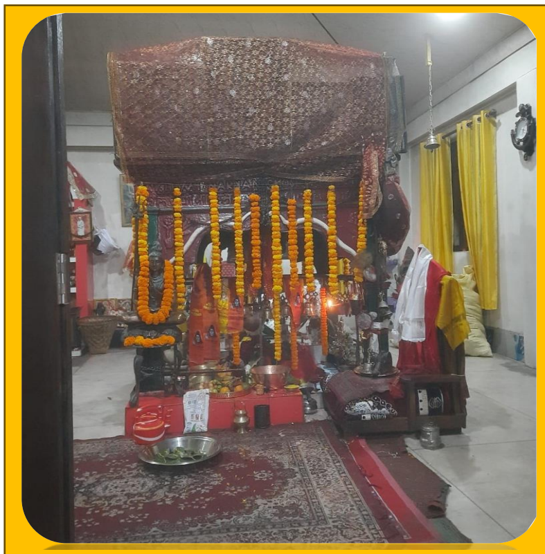
Chataidhura Shiva Mandir

Homestay manager took me to the nearby Shiva temple – preparation was going on. It was just a stone's throw from the homestay. Also, I was taken to the kitchen of the temple, where four persons were actively involved in making 'sel roti' as prasadam for the visitors on 8th March. Shiva stutis were being played in loud speakers. The ambience was excellent.