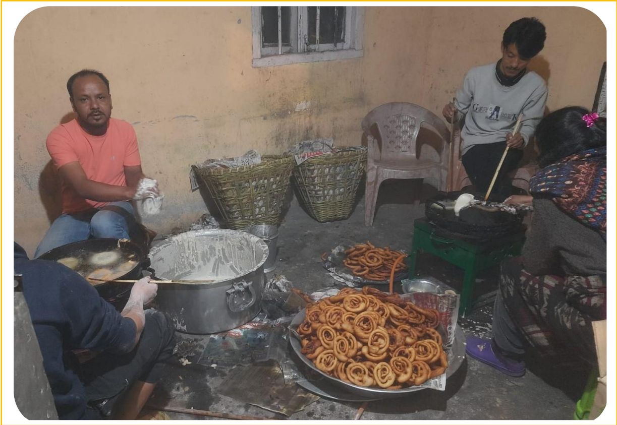
Chataidhura Shiva Mandir kitchen

I came back to my room in the homestay and did dinner with some fruits, soaked kabuli chana and ground nut and roti-sabji, which I carried with me from home. Nowadays, I take food twice only. Once in the morning – in between 9-10 am, and for the second time, in between 8-9 at evening. The menu is similar – in the morning in place of roti, just a cup of cooked rice. Also, at home, with these, I take dal (liquid dal or dal vada) and milk twice. For the rest of the day and/or night, I breath air and drink water, as required (with the exception of some herbs and one prescribed drug and a cup of black tea with two crackers in the morning). I am fine. I am well aware that solar flare is going on with its peak in mid-2024. On the spiritual side, I hope that my present lifestyle will help me to align my body-mind-spirit with the extra energy that is coming down from the Sun.