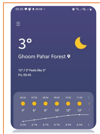
Temperature at Chataidhura on 7 th & 8 th March evening and morning respectively